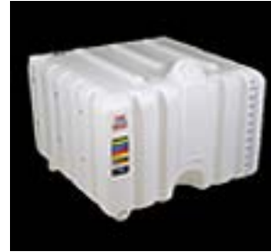
5 year lease to own